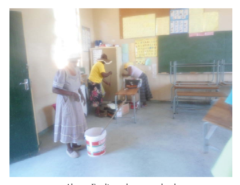
Above: Feeding scheme at school