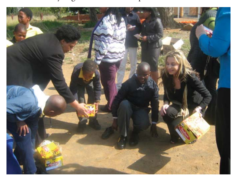
Above: Sponsor from Windmill Casino