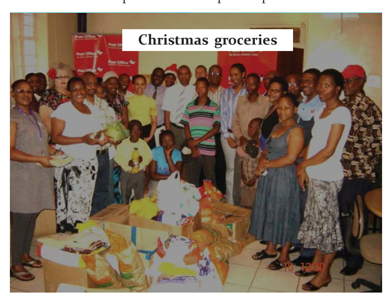
Above: Sponsor from Local Post Office