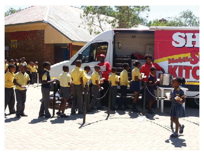
Above: Sponsor from Shoprite Supermarket