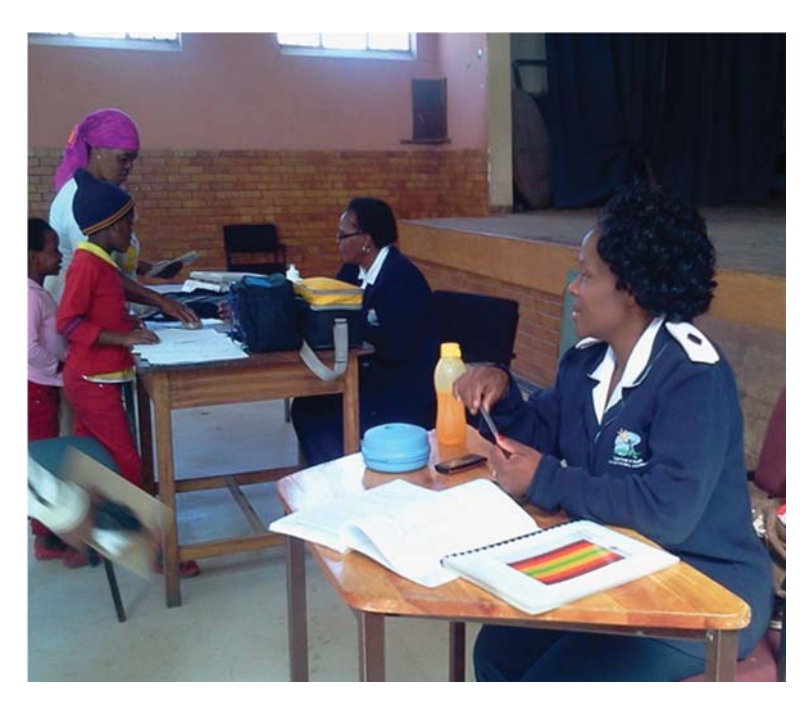
Jamboree Activities, Department of Health